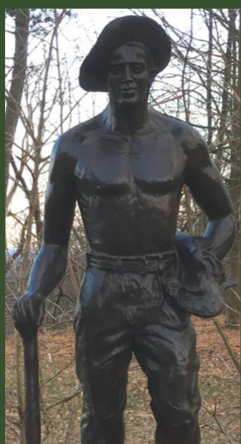
Iron Mike, Gambrill SP.

When I wrote "Welcome to YOUR state parks," in my introduction, I meant it. State parks are set aside for all people and citizens of the state. How they are treated demonstrates how much the community cares. In reality, the community cares as much as the staff who manages them. I am proud to say that I work with a group of partners and individuals who care deeply for these shared spaces. Your contributions, both physically and financially, really do make a difference in our ability to maintain these precious spaces for you and all of the citizens of Maryland. Thank you for all you do and will do in the future.