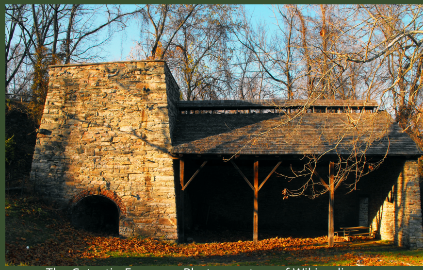
The Catoctin Furnace.