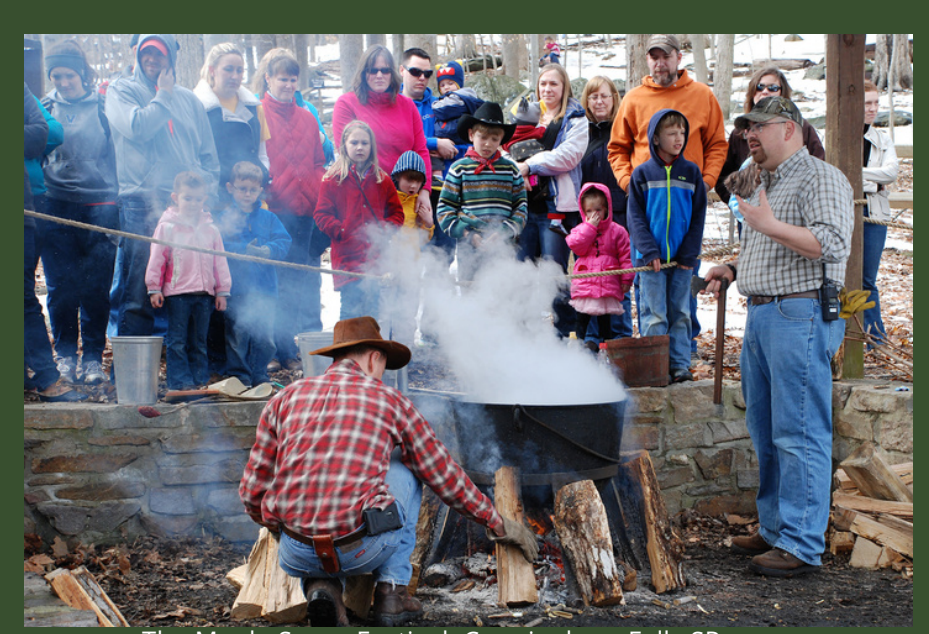
The Maple Syrup Festival, Cunningham Falls SP.